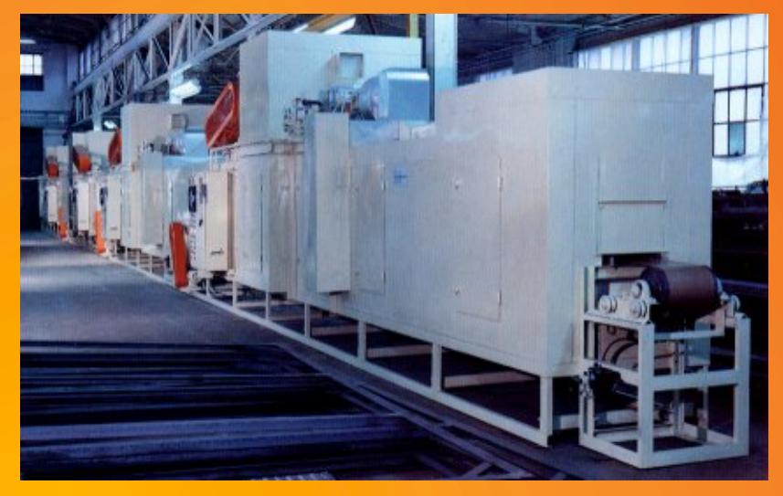
RUBBER - Multi-zone convection oven for curing rubber extrusions in seconds at speeds of 60 fpm.