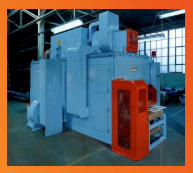
AUTOMOTIVE - Processing driver side air bags.