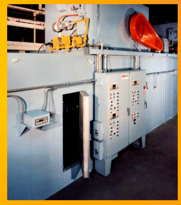
PAINT & POWDER - Complete paint or powder coating and finishing systems.