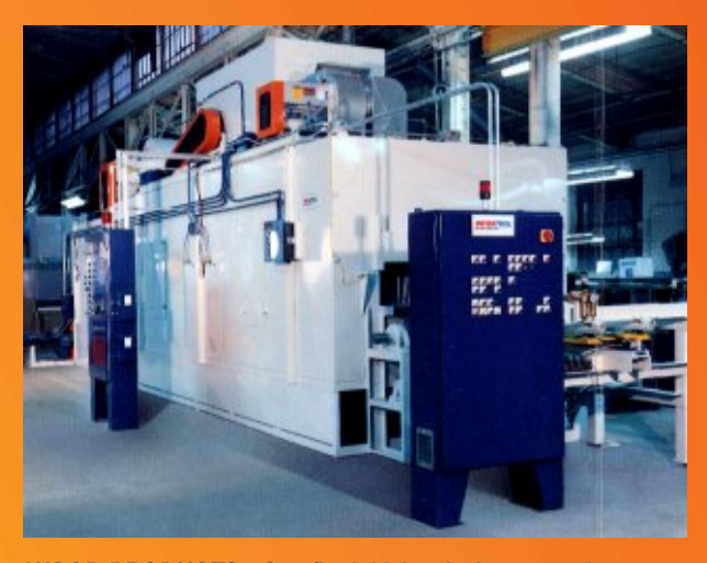
WOOD PRODUCTS - Gas-fired, high velocity convection oven for curing water borne coatings on exterior wood siding. Cure time: 6 seconds at speeds of 400 fpm.