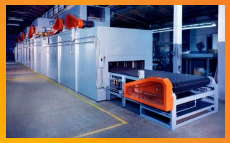
FOUNDRY - Multi-zone conveyorized convection oven and cooler for curing water-based coating on sand cores.