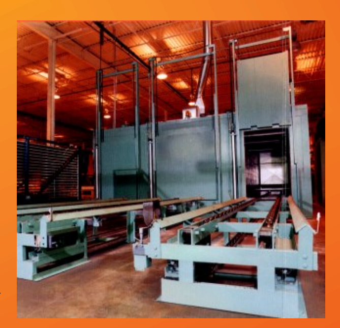
PLASTICS - Molded plastic parts are preheated in this oven and conveyor prior to test and further processing.