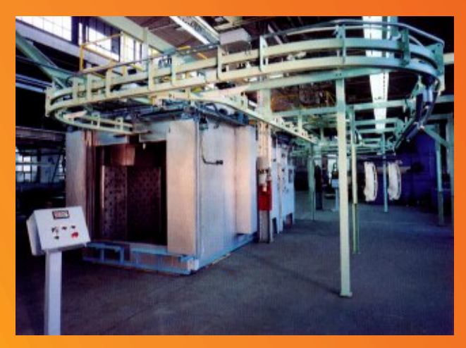
SPECIALIZED CONVEYOR OVENS - Gas or electric ovens with special conveyors including loaders/unloaders and cooler for electronic parts, air bag housings, plastic parts and special castings.