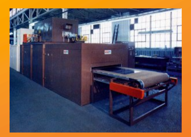
SILK SCREEN - Electric radiant and electric convection oven with cooler to process metal, vinyl and fabric silk screened substrates.