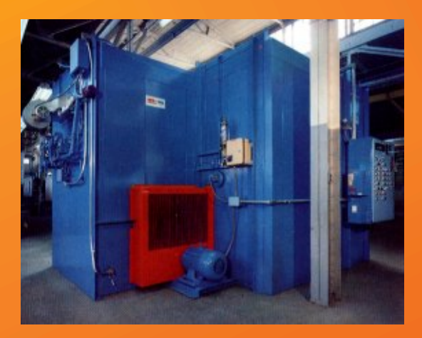
SPECIAL BATCH OVENS - Gas, electric, propane or steam-heated. Vertical or swing doors can be sized to fit the load.