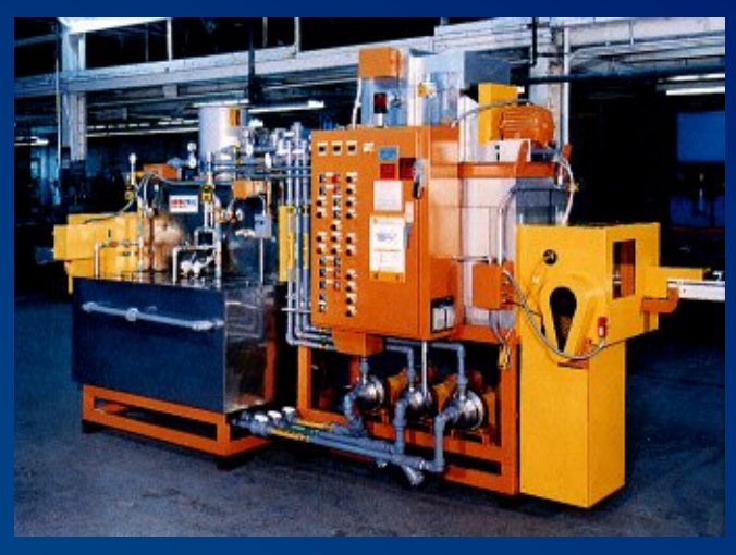
AUTOMATIC IN-LINE PROCESSING - Tooling fixtures are diverted to this 2-Stage combination washer/drier then returned to the production line.