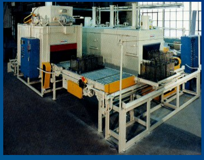
AUTOMATIC BATCH PROCESSING - Baskets of parts are cleaned in a 3-stage process and dried in an integral oven.