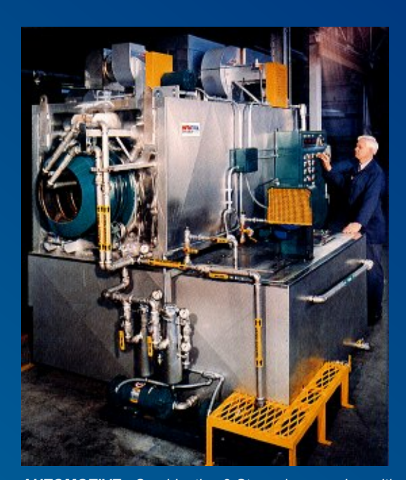
AUTOMOTIVE - Combination 2-Stage drum washer with integral dry-off section for processing small parts.